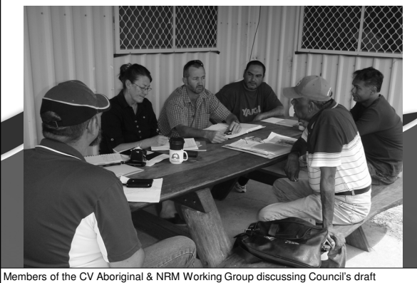
Members of the CV Aboriginal & NRM Working Group discussing Council's draft Consultation Protocol and site mapping project at the Grafton Ngerrie LALC office.