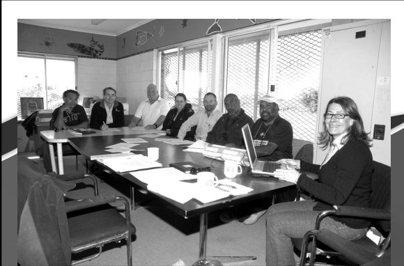
Members of the CV Aboriginal & NRM Working Group discussing ways of improving communication and engagement with the Aboriginal community at the Birrigan Gargle LALC office.